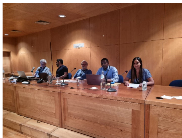
Luhmann's Legacy Panel

It is worth mentioning that there were two more panels at the meeting. The papers presented in those panels complemented the discussions in our Luhmann’s Legacy.