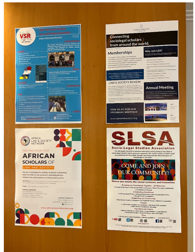
Additionally, the LSA supported the printing and showcasing of A0 sized posters of in total sixteen associations which had been able to respond to the invitation to submit one. These posters not only looked