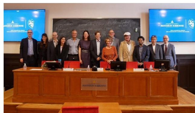
Picture 2: Group photo of participants at the Paris symposium

The most prominent sociological concept of Ehrlich must be the “living law”. Yet, as the discussion in Paris (and at the Frankfurt conference in the following week) also showed, its meaning remains often unclear. The best way to approach this is possibly to distinguish two manners of speech in Ehrlich’s sociology of law. When