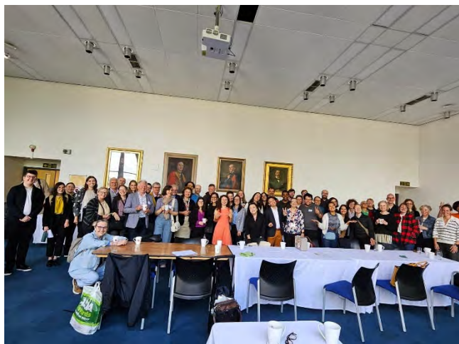
Group photo during the final coffee break

piece shown, the episode "A Study in Murder" (2008) of the Scottish TV series "Taggart", in which he also appears himself as the victim of the crime. The discussion was led by Peter Robson.