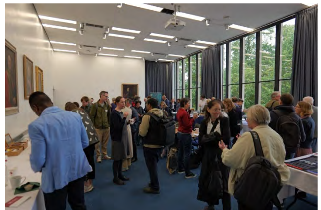
First coffee break