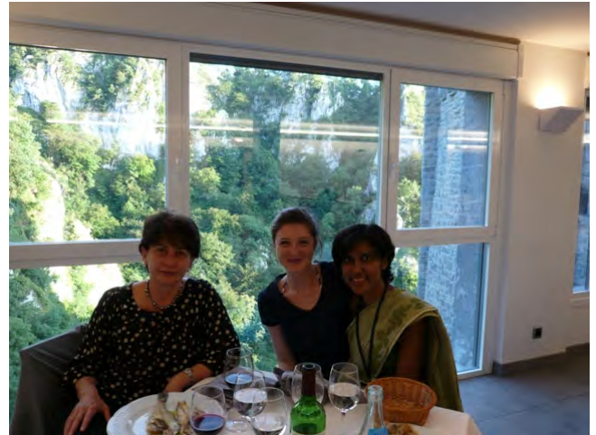
RCSL conference - 20 Years of IISL, Oñati Institute for the Sociology of Law, 2009

With this in mind we are looking forward to our first session at the 2025 ISA conference in Rabat, Morocco, titled "The Contribution of Legal Cultures to Our Understanding of Justice, in the Context of the Anthropocene." This session will explore how legal cultures provide frameworks for understanding justice in the Anthropocene, a period marked by significant human impact on the Earth. We aim to bring together diverse perspectives to examine the role of legal systems within their social contexts, highlighting themes such as environmental justice, human rights, and indigenous legal traditions. Scholars at different levels of their professional careers are invited to submit abstracts (300-500 words).