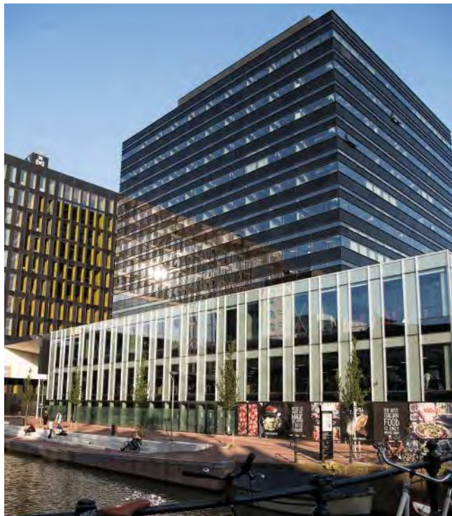
The impressive ACLPA building.

legal practice. The centre maintains a close relationship with legal practice, be it the judiciary, the Dutch Bar or the Municipality of Amsterdam.