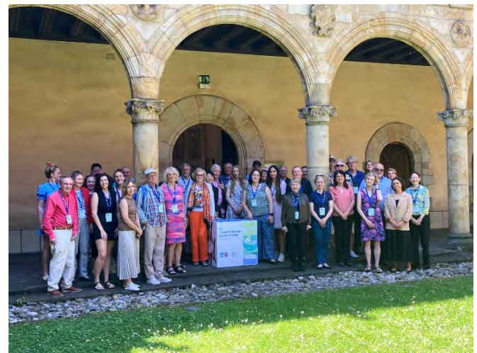
Attendees to the Legal Professional Working Group Meeting

The Meeting began with a Plenary Session discussing the new book "The Making of Lawyers' Careers: Inequality and Opportunity in the American Legal