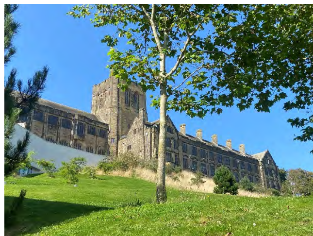
University of Bangor