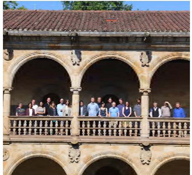
Workshop attendees at the IISL

Ombuds and Policy: The Case of Educational Field; The Ombuds and the Marginalized; Emerging Fields of Ombuds Activity; The Ombuds and Politics; The Role of the Ombuds: "Classical" Attributions and New Tasks; Effective Ombuds and Comparative Perspectives.