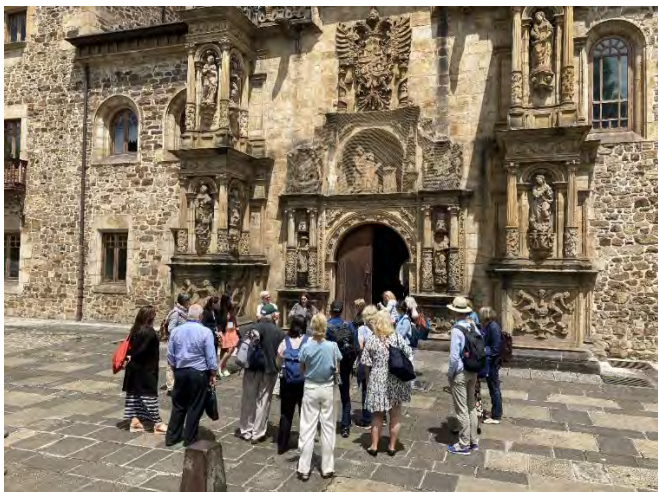
Participants touring the IISJ.