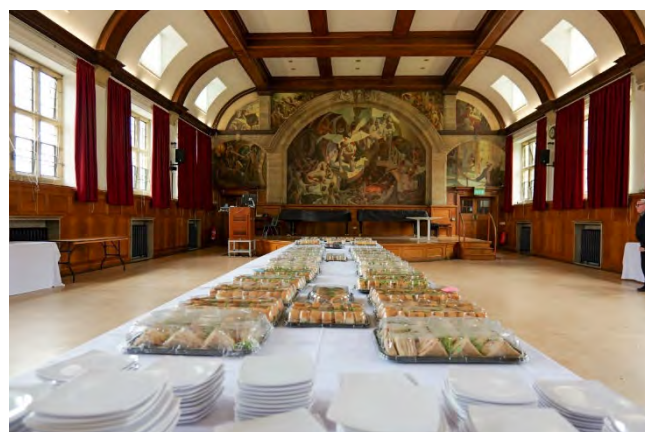
Lunch break in the historic Powys Hall of Bangor University.