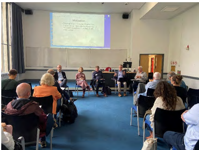
Presentation of the new WG