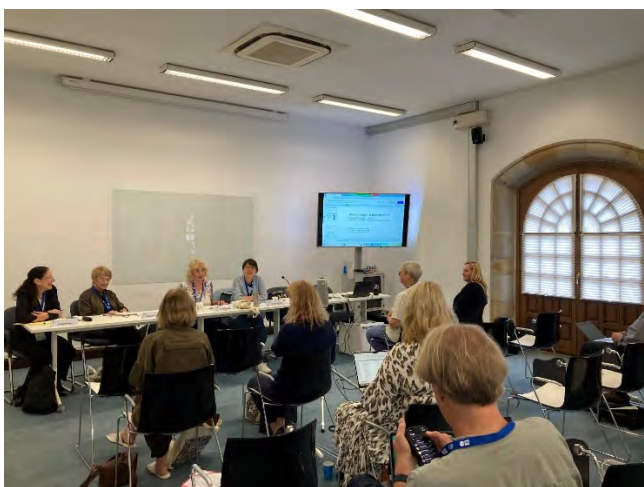
Panel "Women and Gender in the Legal Profession."

After the morning session, attendees received a tour of the IISJ and the San Miguel Church in Oñati, led by the Oñati office of tourism.