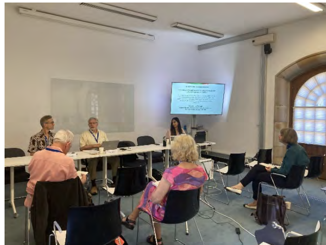
Panel discussion at the LPGM

with legal academics in different research field, experts, and visionaries, to explore innovative strategies and ideas to drive forward progress in our respective fields.