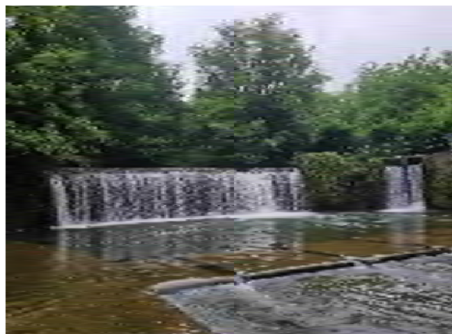
Evening excursion with the Notaries workshop to the waterfalls in Onati

I presented on the equality duties and its regulation in the UK specifically on the theme of lawyers and state transformation. I express my profound gratitude to everyone I met and who gave me helpful comments on my research to date in this area of law. I felt this helped me to develop my knowledge in my research field of legal professionals and understand the wider research communities view on Notaries across different jurisdictions. I hope to share my experience and knowledge with the overall research communities of the University of Warwick. I am also sharing this with professional contacts in specific industries such as (but not limited to) the legal industry in the UK. I have shared details on LinkedIn to grow presence among professional networks of the RC SL initiatives with wider audiences. Together, we are shaping the future of our industries and forging lasting connections.