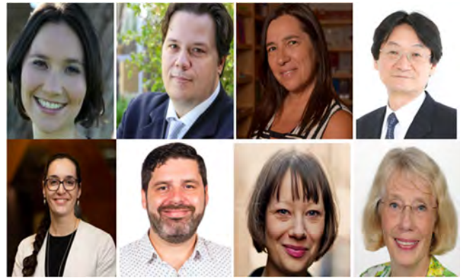
Members of the RCSL programme committee