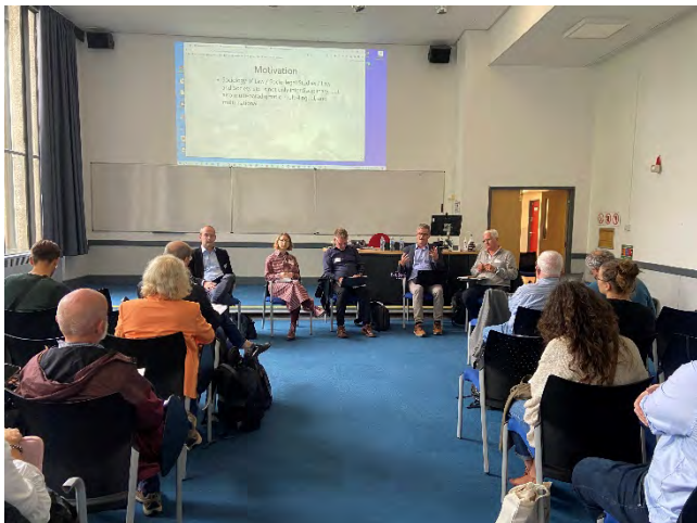
Presentation of the new WG