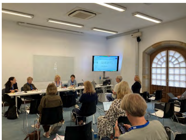
Panel "Women and Gender in the Legal Profession."

After the morning session, attendees received a tour of the IISJ and the San Miguel Church in Oñati, led by the Oñati office of tourism.