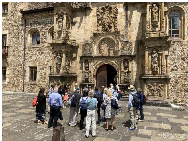
Participants touring the IISJ.