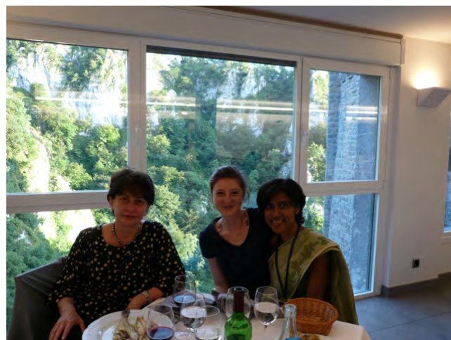
RCSL conference - 20 Years of IISL, Oñati Institute for the Sociology of Law, 2009

With this in mind we are looking forward to our first session at the 2025 ISA conference in Rabat, Morocco, titled "The Contribution of Legal Cultures to Our Understanding of Justice, in the Context of the Anthropocene." This session will explore how legal cultures provide frameworks for understanding justice in the Anthropocene, a period marked by significant human impact on the Earth. We aim to bring together diverse perspectives to examine the role of legal systems within their social contexts, highlighting themes such as environmental justice, human rights, and indigenous legal traditions. Scholars at different levels of their professional careers are invited to submit abstracts (300-500 words).