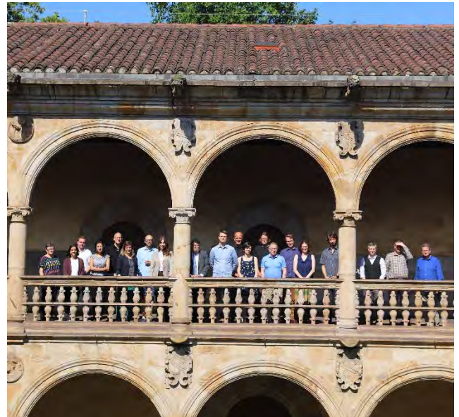
Workshop attendees at the IISL

Ombuds and Policy: The Case of Educational Field; The Ombuds and the Marginalized; Emerging Fields of Ombuds Activity; The Ombuds and Politics; The Role of the Ombuds: "Classical" Attributions and New Tasks; Effective Ombuds and Comparative Perspectives.