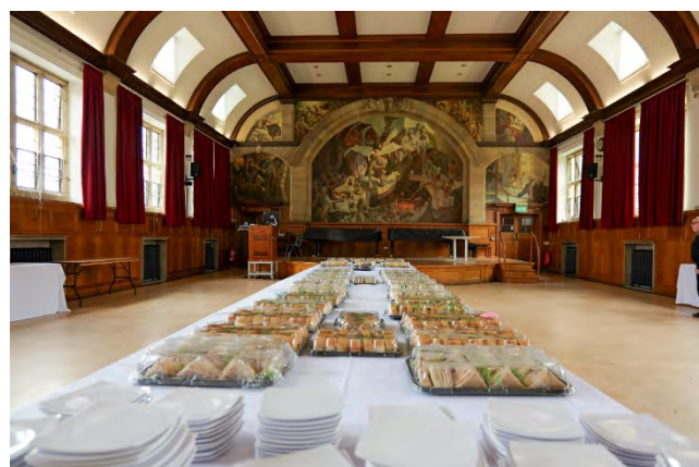
Lunch break in the historic Powys Hall of Bangor University.