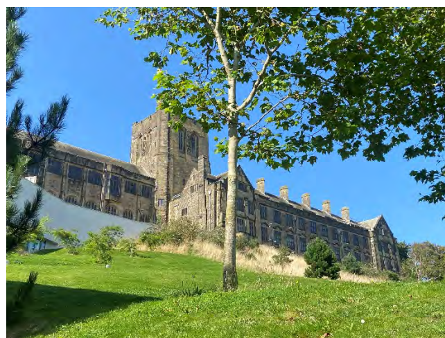
University of Bangor