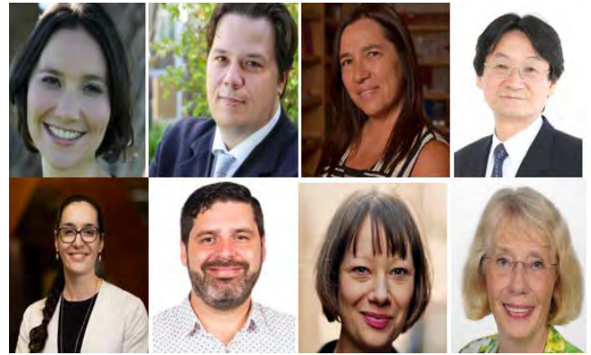
Members of the RCSL programme committee