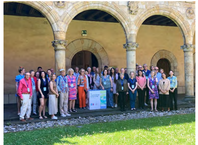
Attendees to the Legal Professional Working Group Meeting

The Meeting began with a Plenary Session discussing the new book "The Making of Lawyers' Careers: Inequality and Opportunity in the American Legal