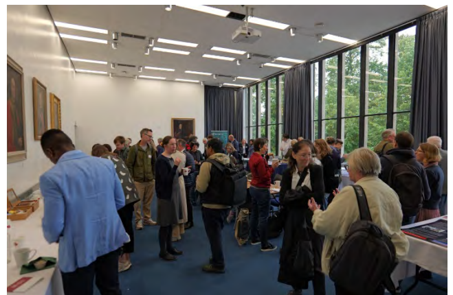
First coffee break