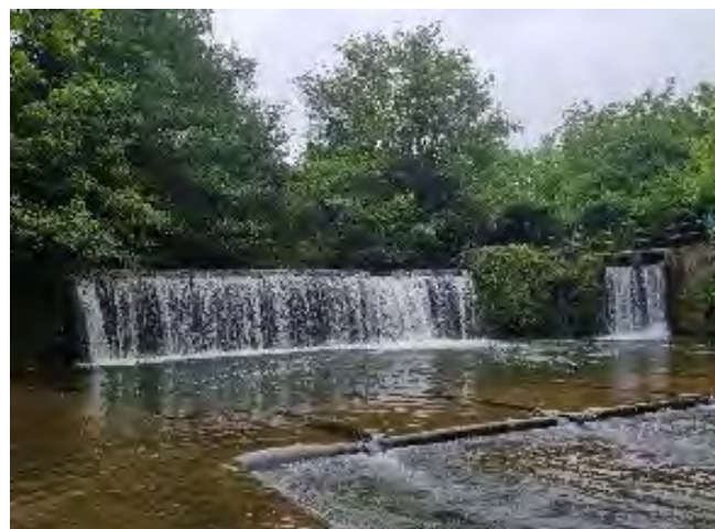
Evening excursion with the Notaries workshop to the waterfalls in Onati

I presented on the equality duties and its regulation in the UK specifically on the theme of lawyers and state transformation. I express my profound gratitude to everyone I met and who gave me helpful comments on my research to date in this area of law. I felt this helped me to develop my knowledge in my research field of legal professionals and understand the wider research communities view on Notaries across different jurisdictions. I hope to share my experience and knowledge with the overall research communities of the University of Warwick. I am also sharing this with professional contacts in specific industries such as (but not limited to) the legal industry in the UK. I have shared details on LinkedIn to grow presence among professional networks of the RC SL initiatives with wider audiences. Together, we are shaping the future of our industries and forging lasting connections.